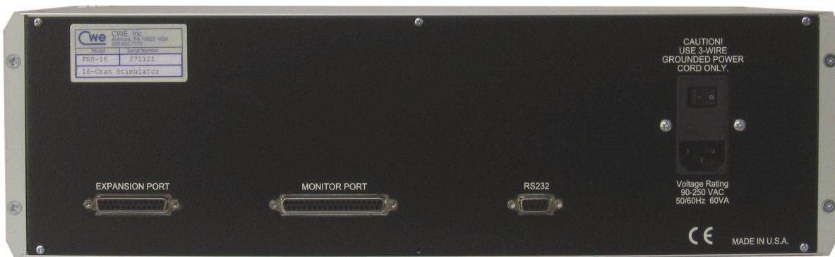
Rear panel showing USB, Monitor and Expansion ports